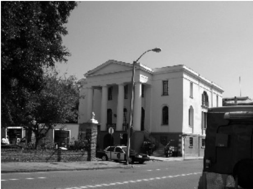
South Carolina Historical Society Building in Charleston, SC. At press time, we have agreed in principal to a partnership with reciprocal benefits for members of the BGES and the SCHS. Watch the Spring 2009 Newsletter for more information