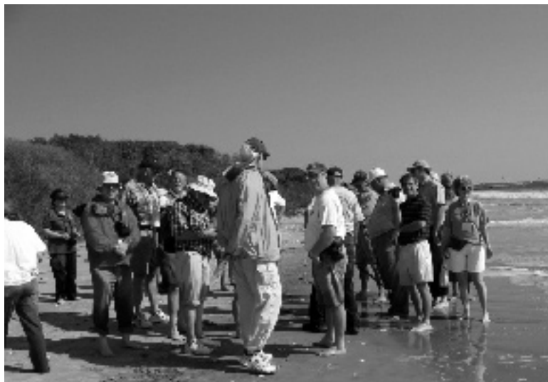
Expect great things! While other groups make a big issue of taking you to private properties as part of their tour package, BGES members know that that is standard operating procedure. Here we are at high tide on Morris Island at Battery Wagner--we waded thigh deep surf to get there after a trip out into the ocean to follow the ship channel past the batteries just like Star of the West and the Union monitors