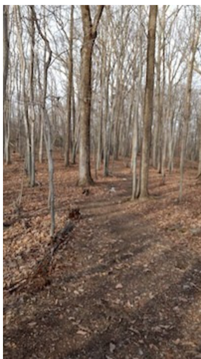
One of the many trails at Blockhouse Point Conservation Park in Maryland.

For those interested, Blockhouse Point Conservation Park is located off River Road in Montgomery County, MD. The park is open daylight hours. Its website, with trail information and a historical summary is here: Block House Point