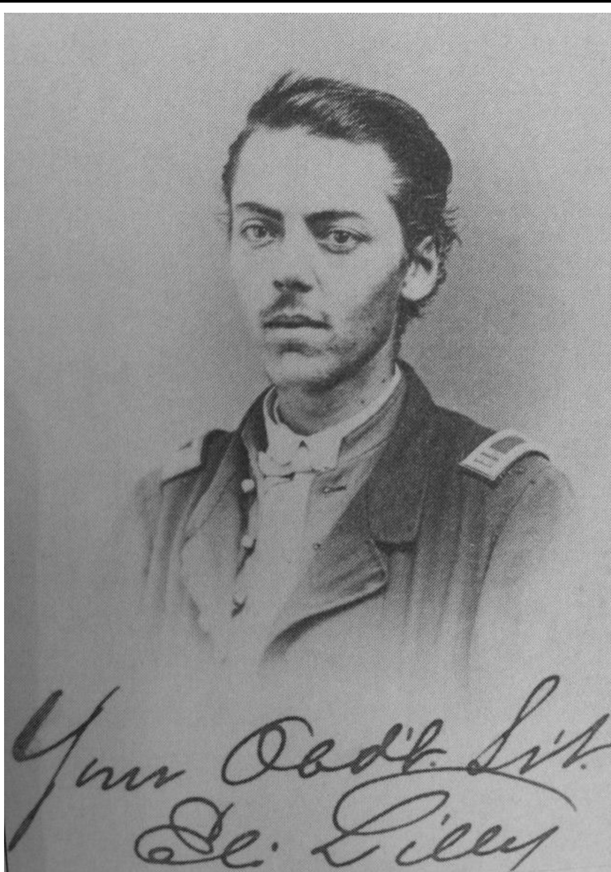
Eli Lilly during the Civil War

By 1864, Eli had decided he needed a change and joined the 9th Indiana Cavalry. Quickly however, he was captured in Alabama, by Confederate General Nathan Bedford Forrest. Shipped to Mississippi he finished the Civil War as a POW.