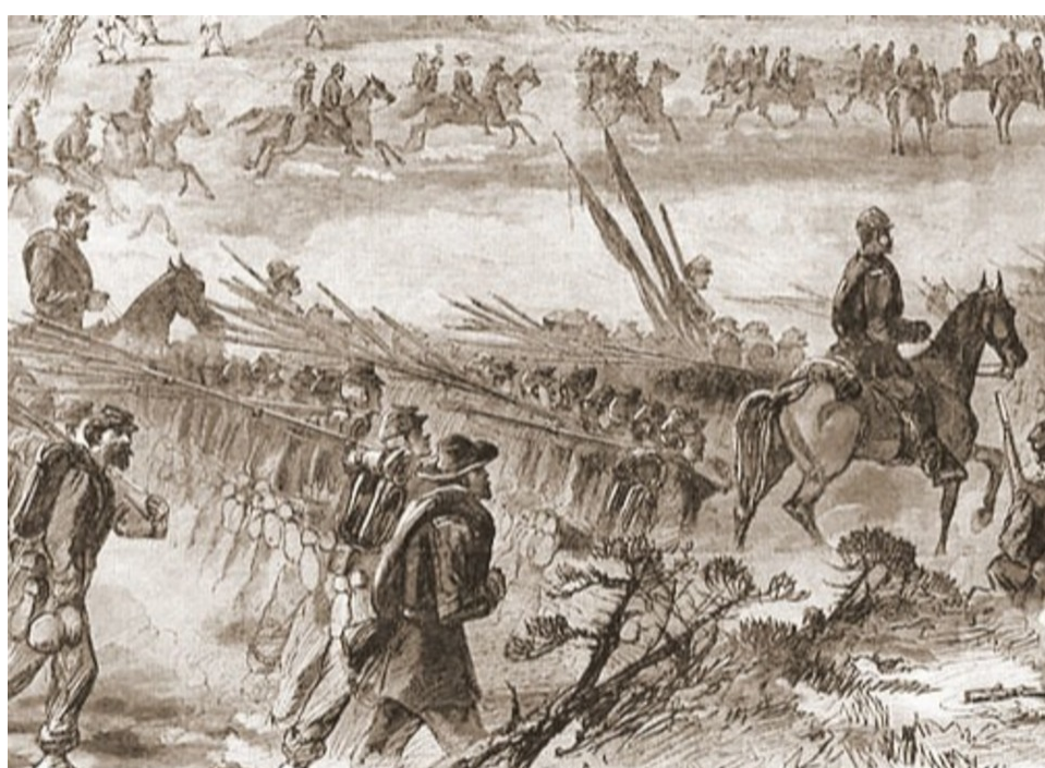
Sherman's army on the march